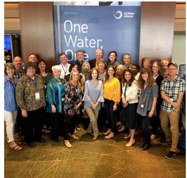
We were happy to be a part of the Hill Country delegation at the One Water Summit in Minneapolis