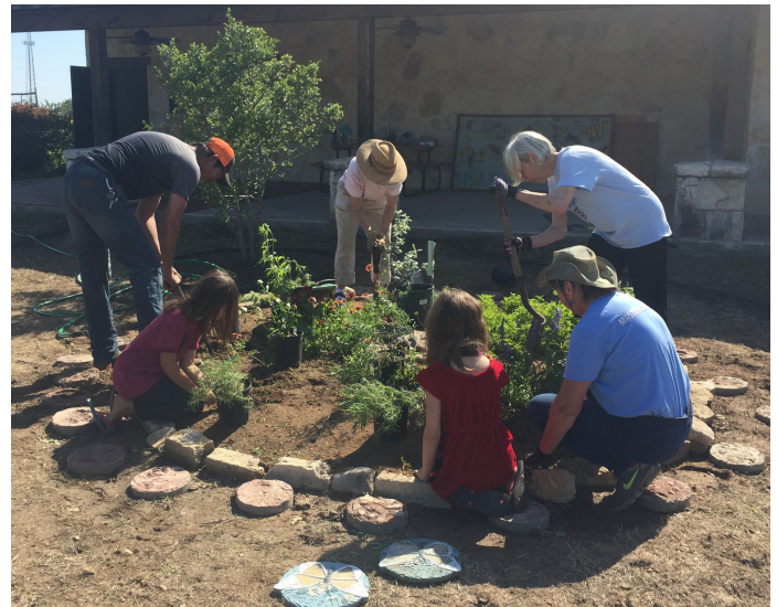
Bringing partners together to learn about and enhance a pollinator garden at the Johnson City Library.

We worked with communities from Mason, Fredericksburg, Johnson City, and Blanco to enhance five demonstration sites on riparian health and pollinators.