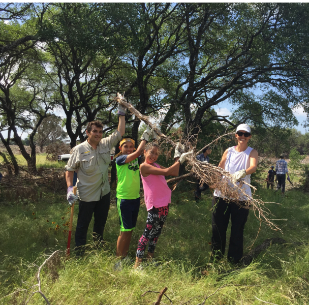
TPWD, HCA, and families worked together at Pedernales Falls State Park.

The Community Program at HCA exists to support our rural communities and urbanizing areas - which we believe to be just as vital to the character of the Hill Country as the land, water, and night skies. By developing and supporting grassroots leadership around the region, the Communities Program has strengthened its impact and deepened its connection to local issues. Highlights of the 2018 Community Program include: