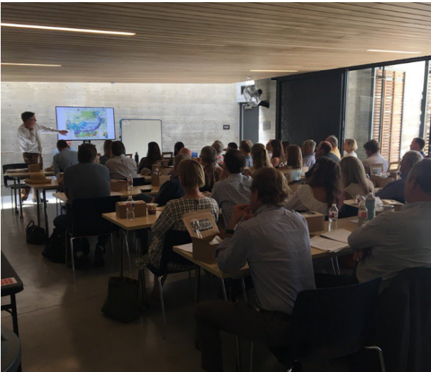
Landowners coming together to discuss how to keep Hill Country springs and rivers flowing for future generations.