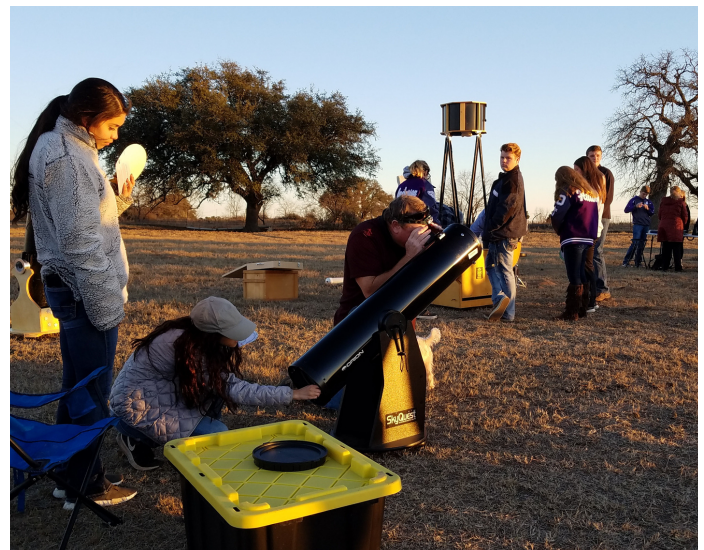
Mason High School Pioneers participate in a star party at the start of their semester-long project.

In the spring, we partnered with the Mason High School Pioneers on multiple efforts in the community - including the launch of a Night Sky Friendly Business Recognition Program through the Mason County Chamber of Commerce.