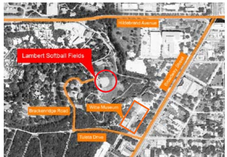
^ Lambert Softball Fields at Brackenridge Park

Brackenridge Park Conservancy City Parks & Recreation Department Guy W. Chipman Construction Facility Rx Clothesline