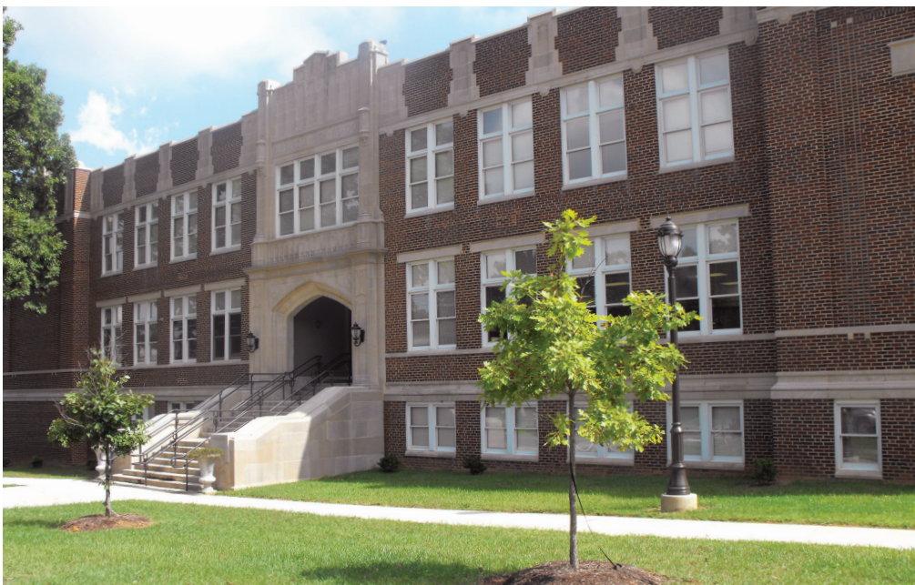
The three-story Albemarle High School building, located in a residential neighborhood in Albemarle County, North Carolina, one block from the central business district, has been a part of the community since 1924. Despite initial opposition from the school board, the community rallied to save the building from demolition. In 2002, it was renovated as Central Elementary School, and residents believe the renovation has contributed to the continued vitality of this rural community.

As communities grow larger and/or older, they face the need for updated educational facilities. Neighborhood schools typically provide historic, sentimental, and even health and safety benefits to neighboring residents, whose children may be able to walk to school. Demolishing old school buildings in favor of