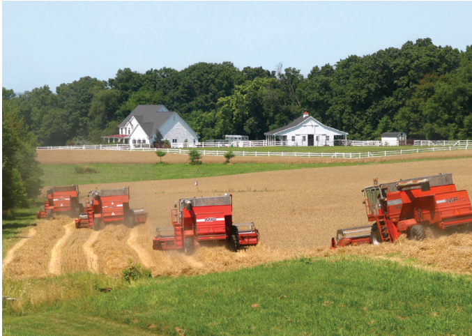
Transfer of development rights policies and priority funding areas protect undeveloped land while promoting increased density and development in existing neighborhoods and downtowns, as illustrated by these examples from Montgomery County, Maryland.