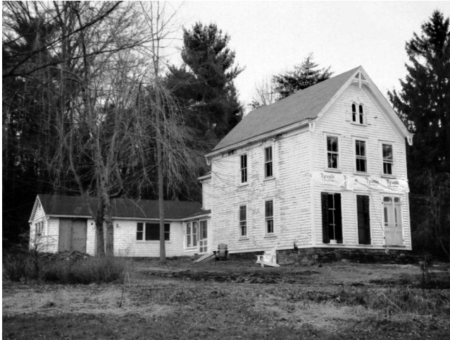
Renovating existing buildings can help preserve a community's historic assets, as these before and after photos of the James Dean House in Rosemont, New Jersey, illustrate.