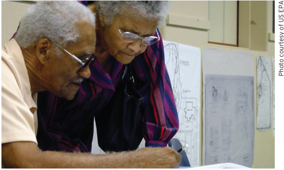
Residents can help determine priorities for preservation and new growth.

assist in stormwater management and reduce the heat island effect; using the public right-of-way for multiple purposes, such as trails that can permit both stormwater management and recreation; and strategic plantings to allow biofiltration to treat runoff and improve water quality. A more specific example might be a tree canopy that absorbs excess runoff, lowers roadway temperatures, and improves air quality. This kind of amenity not only reduces infrastructure demand but also can improve a community's appearance and help it support active transportation, including walking and bicycling.