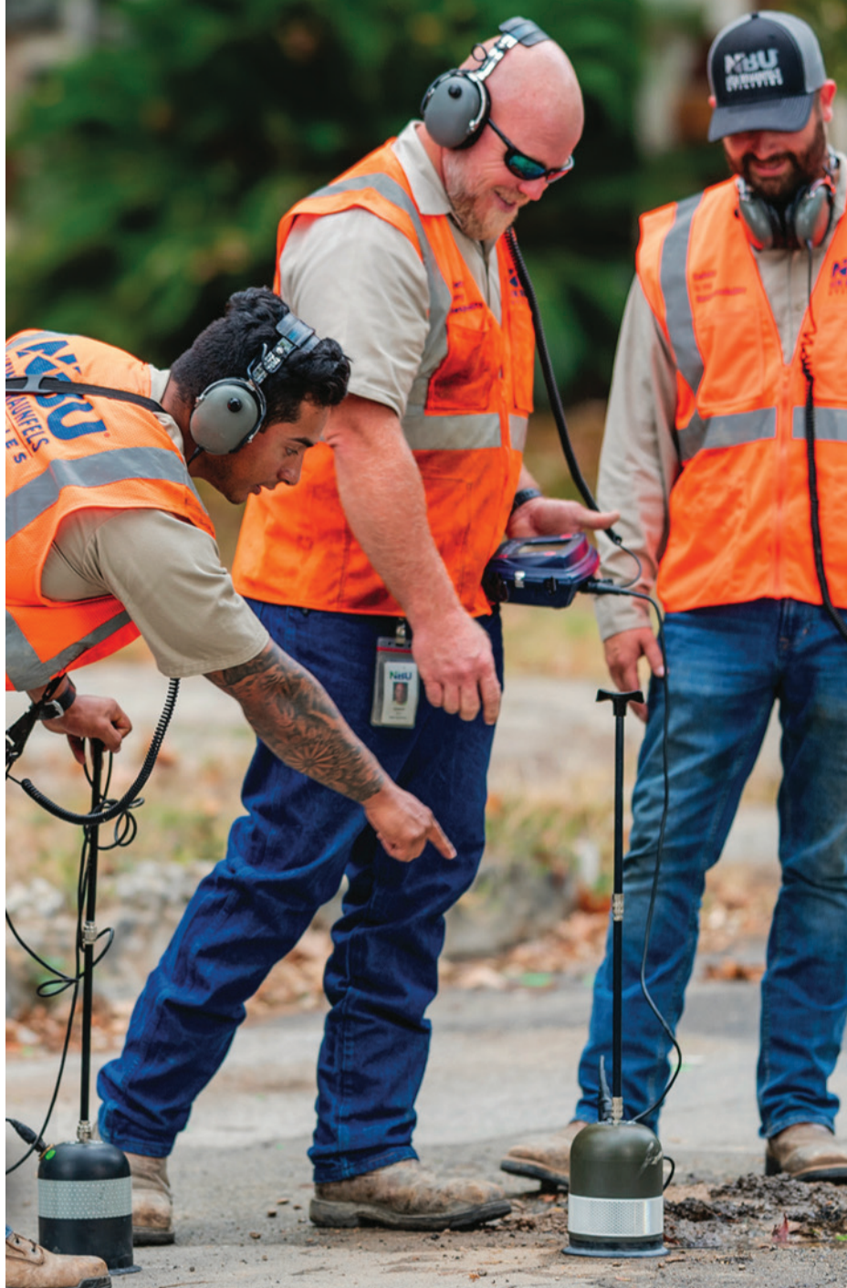
Above: Acoustic leak detection is a cost-effective method of tracing water loss.

More data on water loss at hiddenresevoirs.org