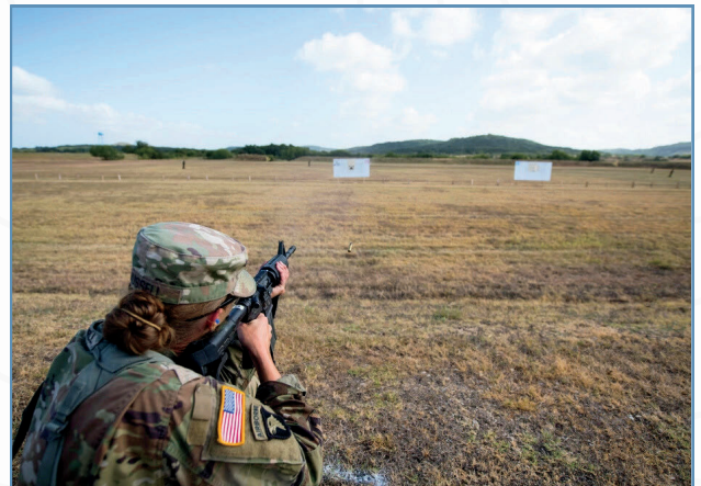
JOINT BASE SAN ANTONIO-CAMP BULLIS