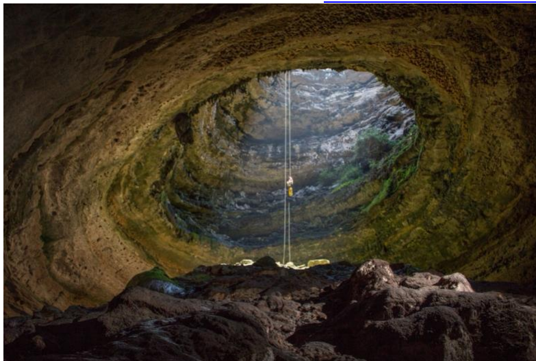
Grand: Geary Schindel – Into the Depths, Devils Sinkhole (Edwards County)

Click here to view shareable copies of all winning photos.