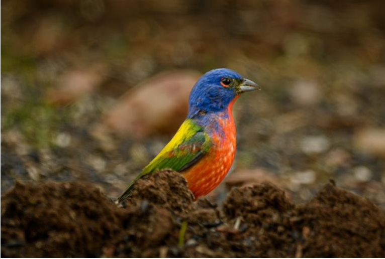
First: Phil Ort – Painted Bunting (Burnet County)